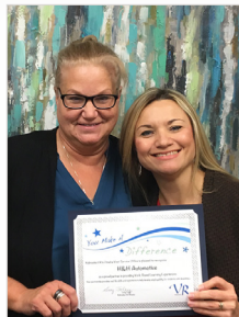
H&H Automotive - Omaha

Fast Forward/MS Forward Furst McNess Game and Parks - Fremont Glenn's True Value Goodwill Lexington Graham Tire Gretchen's Grooming Grocery Mart H&H Automotive Harvest Moon Farm Huddle House HyVee - Fremont Ideal Linen North Platte Johnson's Lake State Rec Area/ NE Game & Parks-Lexington Kniedler Automotive - Gothenburg