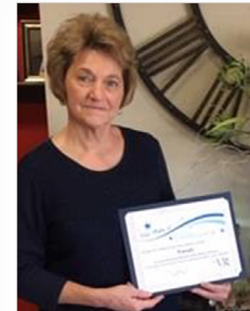
Ramada - Columbus

Mutual of Omaha Myers Salvage Nebraska Department of Transportation Noah's Arc Open Door Mission Orthman's Lexington Plains Equipment Group Platte Valley Bank Quality Inn North Platte Ramada