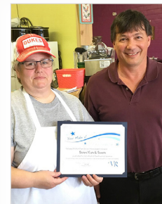
Sisters' Eats & Sweets - N. Platte

Red Bird Bakery Ross Automotive Sapp Brothers Travel Center Sayler Screenprinting Sears Seeker Transport Sehnert's Bakery Sehnerts Sempeck's Bowling and Entertainment Sid Dillon Sisters' Eats & Sweets