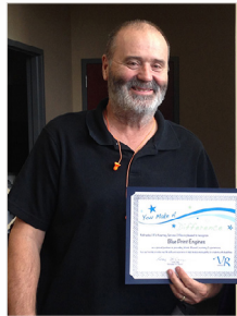
Blue Print Engines - Kearney

AA-1 United Heating & Air Conditioning American Butchers Ameristar Casino Inc. Animal Shelter of Northeast NE Antelope Memorial Hospital Applebee's RMH Franchise Bakers - Fremont Baxter Auto Beatrice Ford Behlen Technology & Manufacturing Blair Library Blue Print Engines