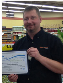
Family Fresh Market - Norfolk

Broken Mug Bureau of Sociological Research Butler-Gast YMCA Cabela's Carpenter Center CHI Health St. Francis City of Lexington Cobblestone Hotel & Suites Columbus Community Hospital/ Premier Physical Therapy Cozad Child Care Dusters Eaton Corporation Elwood Market Entrap Games Family Fresh Market